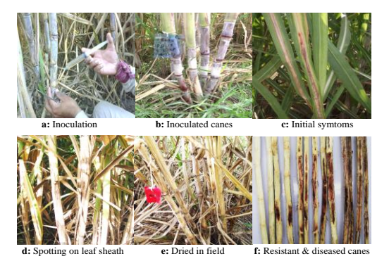
Fig. 1: Screening cycle of plug technique for testing sugarcane germplasm against red rot

The sugarcane genotypes developed from fuzz belongs to three different international origins are differed for their resistance or susceptibility against red rot pathogen. The disease reaction of genotypes to red rot not only varied among germplasm sources but also at various stages of varietal development program as the resistivity increased with genotypes progressed to next phase. It was noticed that among 724 sugarcane genotypes, 425 examined resistant, 141 moderately resistant, 48 moderately susceptible and 110 susceptible to red rot in disease screening (Fig. 2).